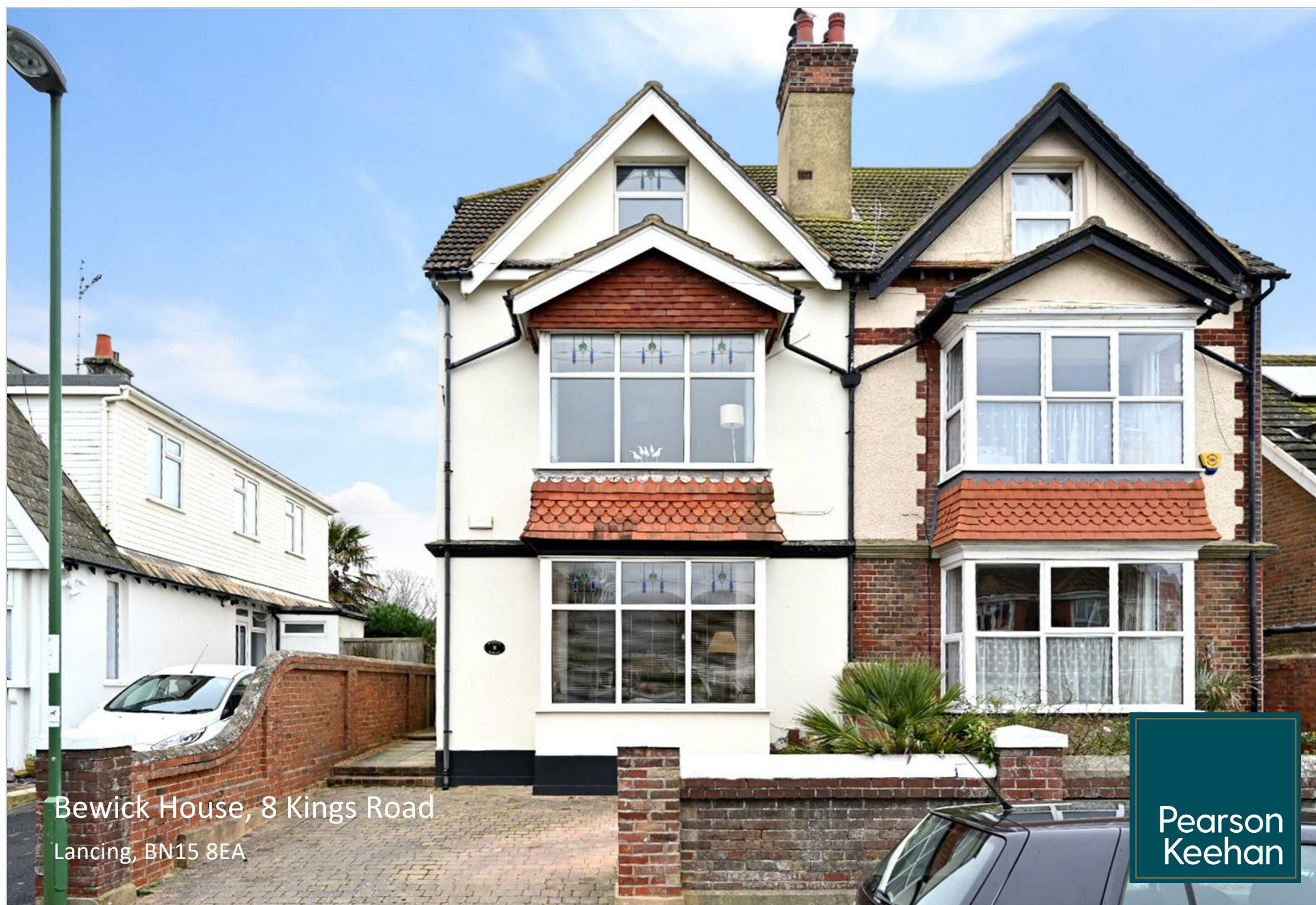
Bewick House, 8 Kings Road Lancing, BN15 8EA